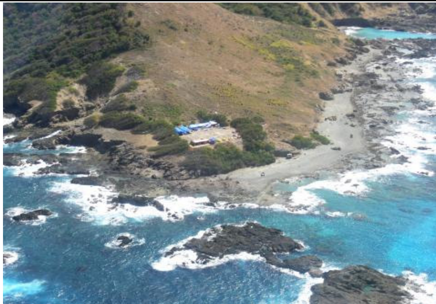
Desecheo Island site

In 2002 a group was formed with the purpose of activating Desecheo and